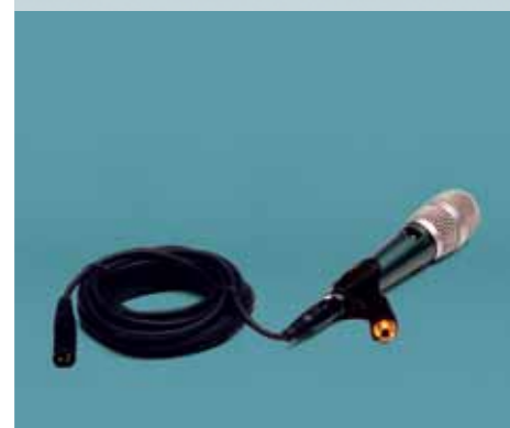
ITEC EM-300 hand-held microphone

The EM-300 is an all-purpose microphone with excellent polar pattern. It is a high-end product to use for speech, singing and music.